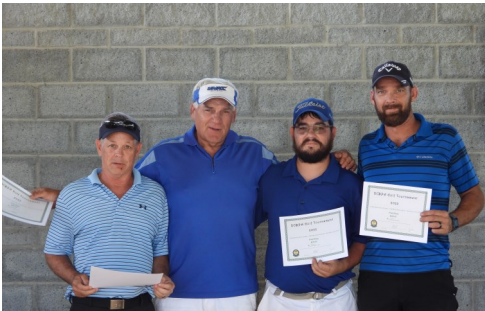
2022 CLASSIC WINNERS

(see the entry form on the other side of this flyer).