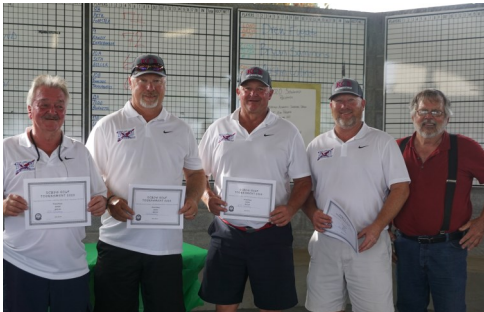
2020 CLASSIC WINNERS

(see the entry form on the other side of this flyer).