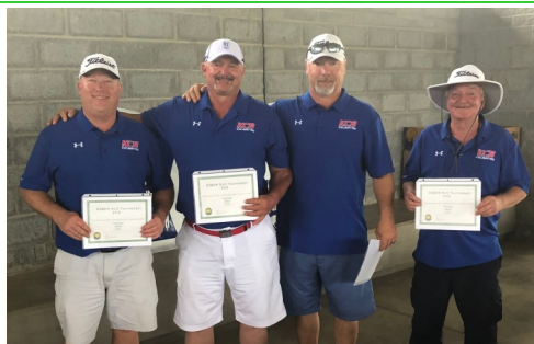
2019 CLASSIC WINNERS

(see the entry form on the other side of this flyer).